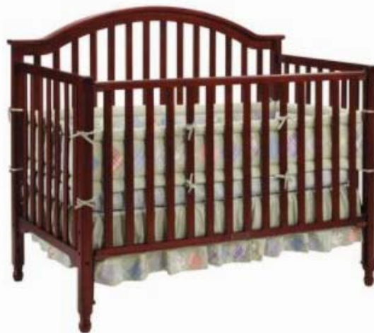
Dorel Asia's Lexington Collection 3-in-1 Convertible Crib

The Lexington Collection cribs have drop sides with plastic latches that allow the side of the crib to move up and down for easier access. The Biccums believe that these plastic latches are prone to breaking as occurred with their crib. When they break, they can cause detachment of the drop side and create a dangerous gap into which an infant can become entrapped.